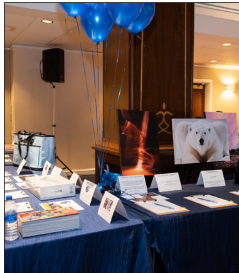
2018 FCBA Charity Auction