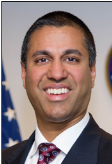
FCC Chairman Ajit Pai

The 33rd Annual Chairman's Dinner will be held Tuesday, December 10 at the Washington Hilton, 1919 Connecticut Avenue, NW. The evening will begin with a reception at 5:45 p.m. followed by dinner at 7:15 p.m. in the International Ballroom and will be followed by remarks from FCC Chairman Ajit Pai. Sponsor's tables include a $350.00 tax deductible donation to the FCBA Foundation.