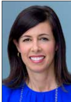
FCC Chairwoman Jessica Rosenworcel

The 34th Annual Dinner featuring Chairwoman Rosenworcel will be held Thursday, December 15 at the Marriott Marquis, 901 Massachusetts Avenue, NW . The evening will begin with a reception at 5:45 p.m. followed by dinner at 7:15 p.m. in the Marquis Ballroom and will be followed by remarks from FCC Chairwoman Jessica Rosenworcel. Tables include a $250.00 tax deductible donation to the FCBA Foundation.