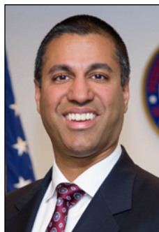
Chairman Ajit Pai

The 33rd Annual Chairman’s Dinner will be held Tuesday, December 10 at the Washington Hilton, 1919 Connecticut Avenue, NW. The evening will begin with a reception at 5:45 p.m. followed by dinner at 7:15 p.m. in the International Ballroom and will be followed by remarks from FCC Chairman Ajit Pai. Sponsor’s tables include a $350.00 tax deductible donation to the FCBA Foundation.