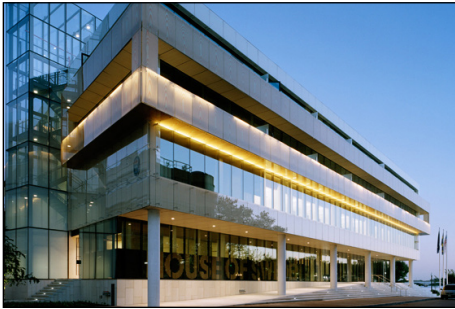
House of Sweden