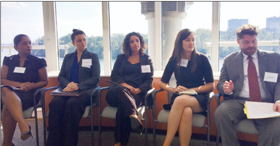
Panel 1 at the Universal Service Fund seminar