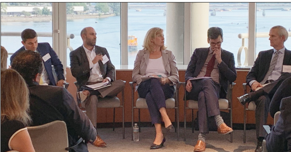
Panel 2 at the Universal Service Fund seminar