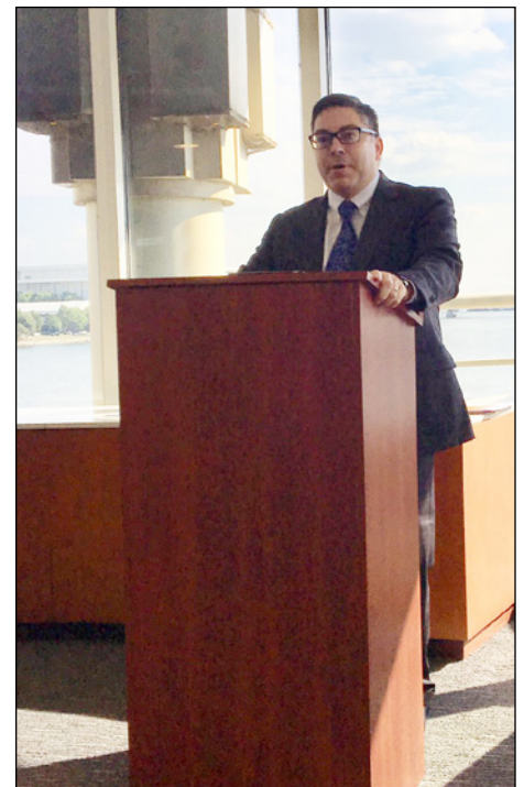
FCC Commissioner Michael O'Rielly