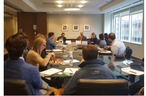
The YLC and Judicial Committee co-host a brown bag on September 30