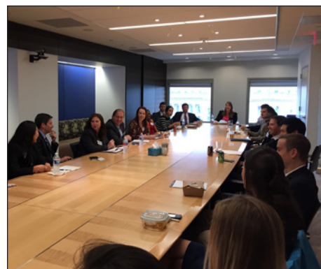
October Brown Bag Breakfast