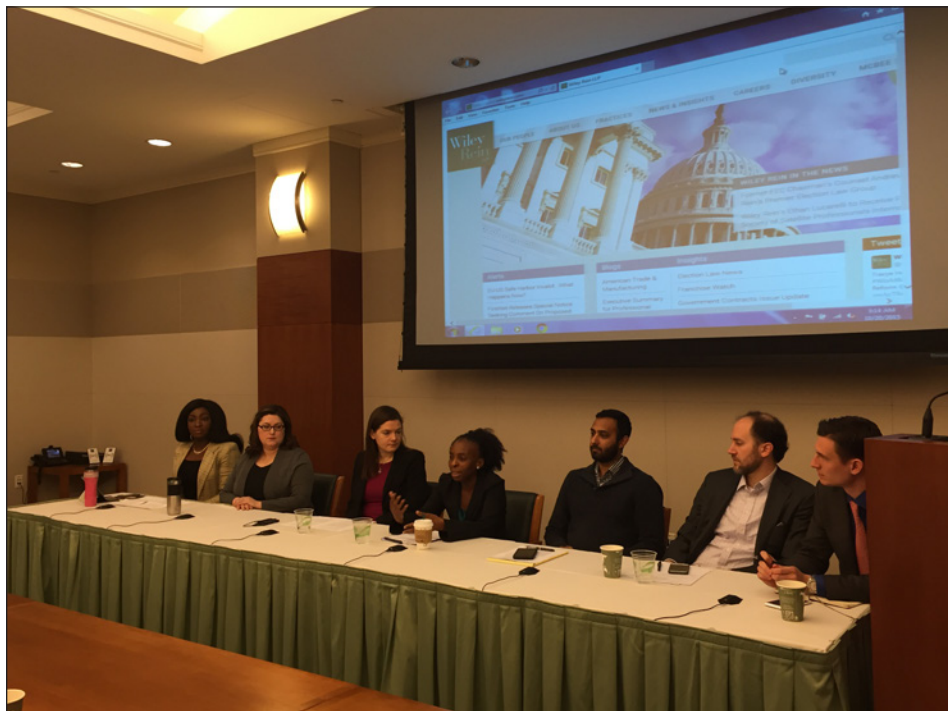
Panelists at the YLC October Brown Bag Lunch

To register, click here or go to the FCBA Website – Calendar of Events or use the form on page 14 .