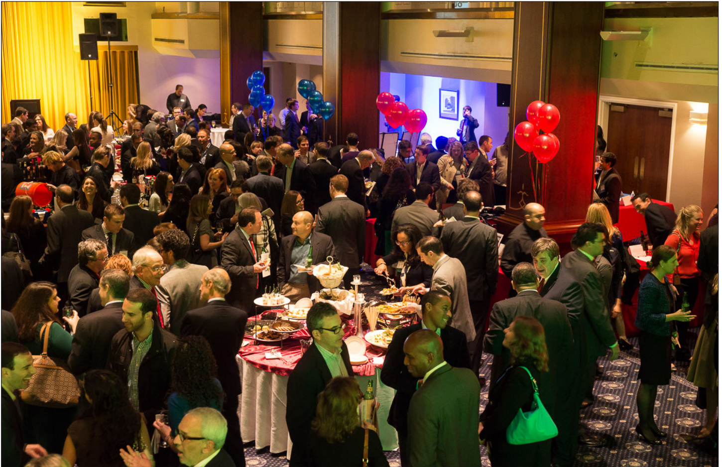
2014 FCBA Charity Auction