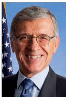
FCC Chairman Tom Wheeler

The 29th Annual Chairman’s Dinner will be held Thursday, December 3 at the Washington Hilton, 1919 Connecticut Avenue, NW. The evening will begin with a reception at 6:00 p.m., followed by dinner at 7:30 p.m. in the International Ballroom and will be followed by remarks from FCC Chairman Tom Wheeler. Sponsor’s tables include a $350.00 tax deductible donation to the FCBA Foundation.