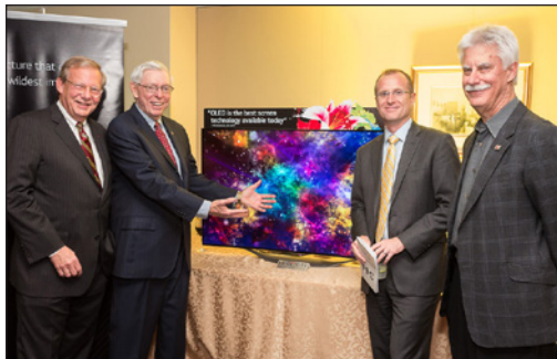
2014 FCBA Charity Auction