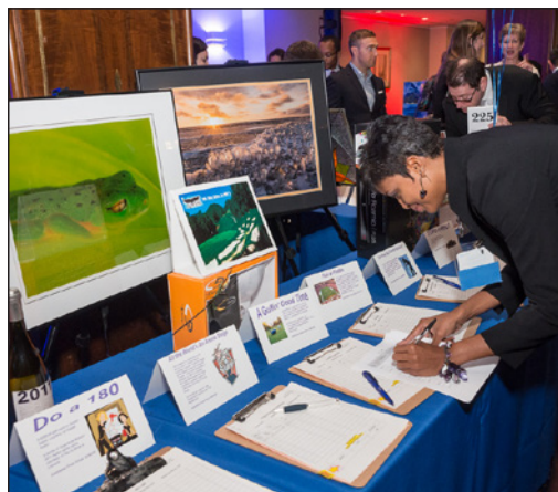
2013 FCBA Charity Auction

BUILD Metro DC offers a four-year program that targets high school students in low-income communities who are not on-track academically and are at the highest risk of dropping out of school. Through entrepreneurship-based, experiential learning, BUILD equips these youth for high school, college, and career success. From their freshman through senior year of high school, BUILD guides participating students through every step of starting and running a licensed business, including writing a business plan, working in teams, pitching investors, budgeting, manufacturing, and selling products. "BUILDers" also receive extensive academic training, including