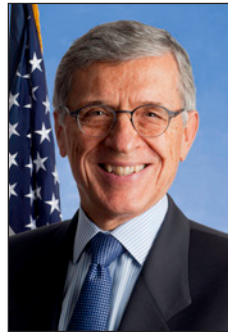
FCC Chairman Tom Wheeler

The 28th Annual Chairman's Dinner will be held Thursday, December 4 at the Washington Hilton, 1919 Connecticut Avenue, NW. The evening will begin with a reception at 6:00 p.m., followed by dinner at 7:30 p.m. in the International Ballroom and will be followed by remarks from FCC Chairman Tom Wheeler. Sponsor's tables include a $350.00 tax deductible donation to the FCBA Foundation.