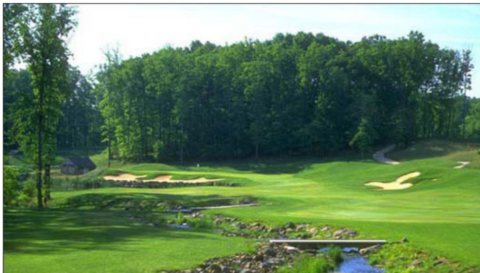
Westfields Golf Club Hole No. 16

As always, all of the proceeds from the Tournament go straight to the FCBA Foundation to support its wonderful programs, including the Scholarship programs and the Summer Legal Internship program. Over the years, the Tournament has raised nearly $400,000