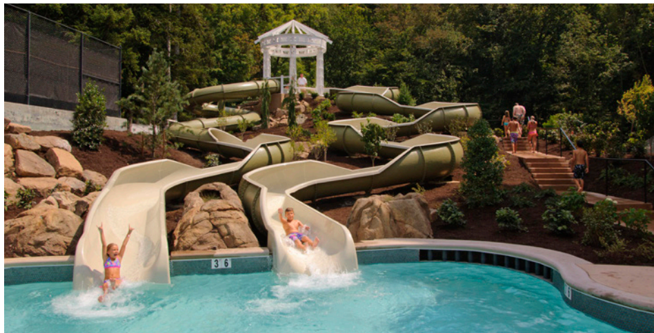
Water slides in Allegheny Springs

As a result of the Springfest, the FCBA-sponsored gorge hike activity has been cancelled. The resort, however, does offer the hike at 1:00 p.m. on Saturday. You will need to call the hotel at (800) 838-1766 to make a reservation.