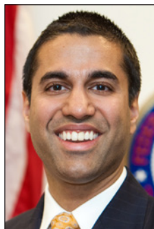
Commissioner Ajit Pai

The FCBA will be holding a luncheon in conjunction with its annual meeting on Wednesday, June 18, 2014 . The program will include announcement of the FCBA election results, a presentation of awards, as well as recognition of scholarship and internship awardees, lunch, and remarks by FCC Commissioner Ajit Pai . The luncheon