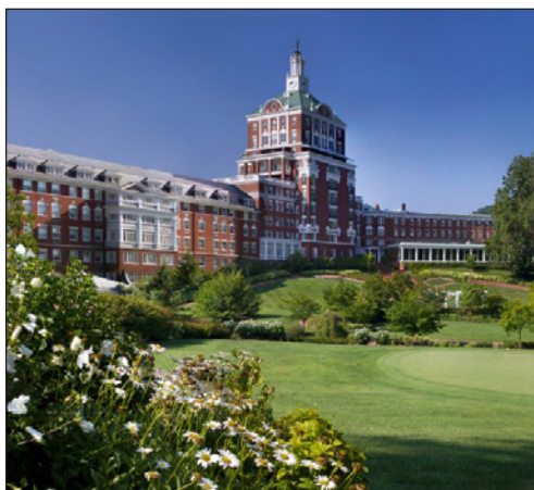
The Omni Homestead Resort

Newsletter of the Federal Communications Bar Association