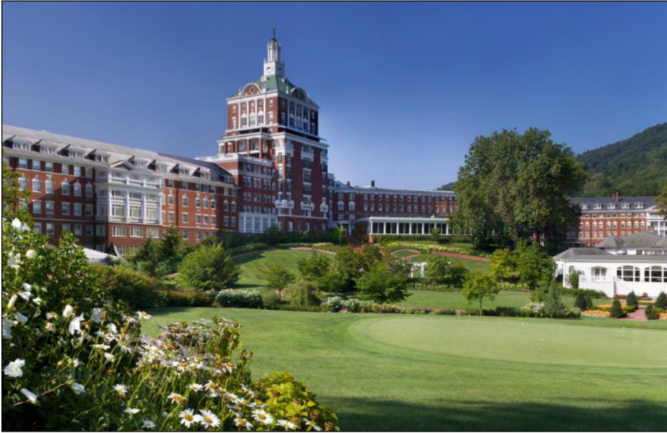
Omni Homestead Resort