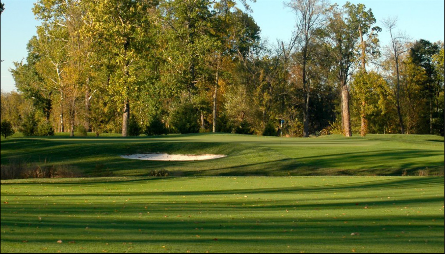
1757 Golf Club