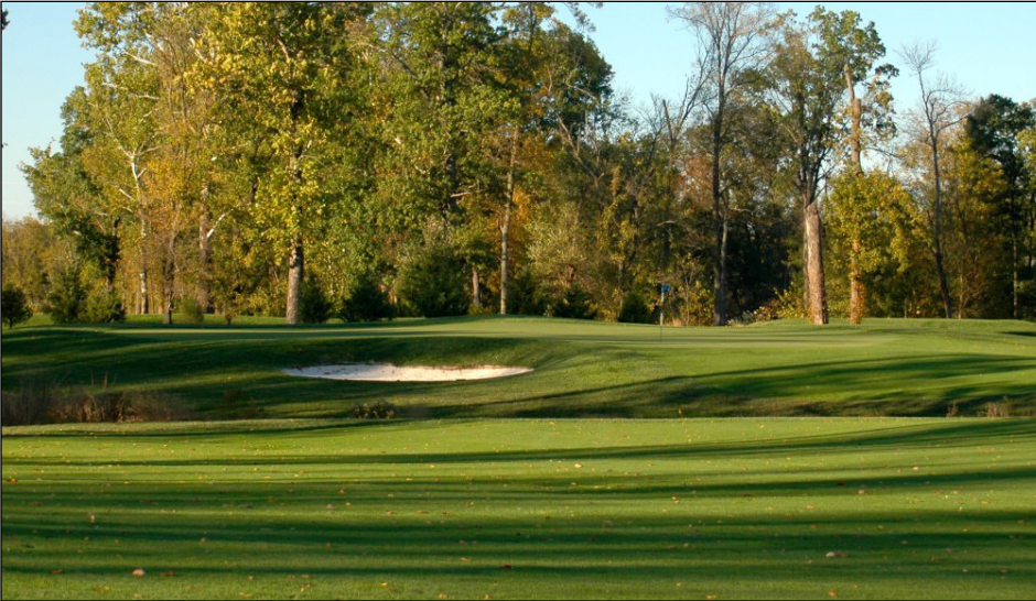
1757 Golf Club