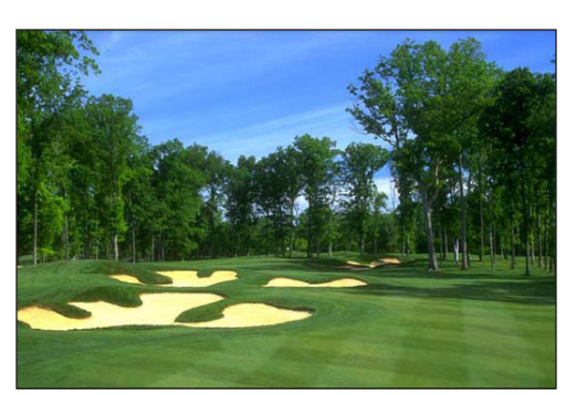
Westfields Golf Club

Many thanks to Microsoft Corporation for being the Platinum Sponsor for the reception! Gold and Silver sponsorships of the Spring Reception are also available for $650 and $350 and include registrations to the reception. Sponsors will receive recognition in the newsletter and acknowledgement at the event. Individual tickets to the reception also may be purchased.