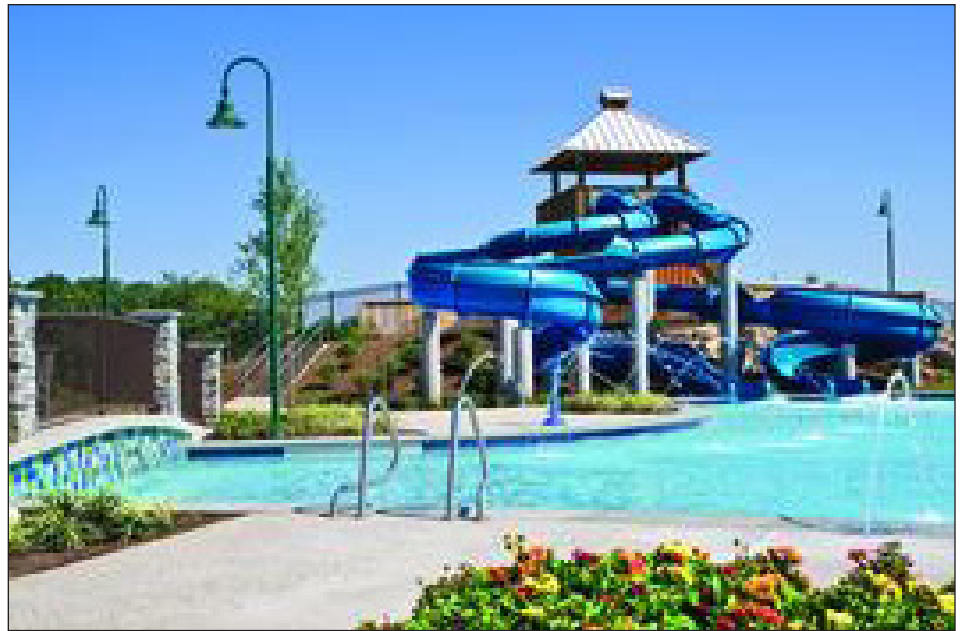
Pool Complex at the Hotel Hershey

It's all about chocolate in Hershey! You'll find chocolate everywhere you turn; the air even smells like chocolate in Hershey, PA. From chocolate desserts on every menu, to chocolate specialty drinks at