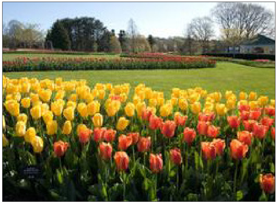
Tulip Gardens at the Hotel Hershey

Please see page 26 for information on the government and academic scholarships being offered.