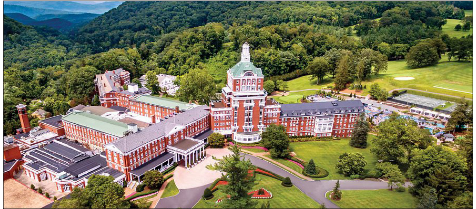
Omni Homestead Resort

IMPORTANT ROOM RESERVATION INFORMATION: THE FCBA SPECIAL GROUP RATE WILL ONLY BE GUARANTEED THROUGH MONDAY, MARCH 7.