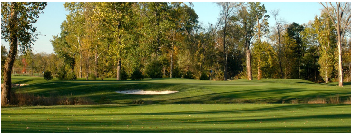
1757 Golf Club in Sterling, Virginia