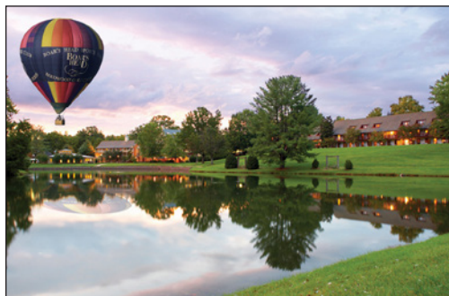
Boar's Head Inn

Mark your calendars now and join your colleagues at the 2016 FCBA Annual Seminar at the Boar's Head Inn in Charlottesville, VA. The Annual Seminar Committee is planning what promises to be an outstanding program filled with the latest information on telecom issues and great networking opportunities. The seminar will feature panels including FCC Commissioners, past and present FCC general counsels, NTIA leadership, Hill staff, FCC Bureau Chiefs, and cybersecurity experts – all addressing the topic “Advice to the Next Administration.” Be sure to watch the FCBA website in the coming weeks for a full agenda for the weekend and updates to speakers for the various panels.