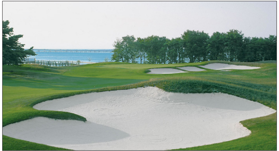
The River Marsh Golf Club

Reservations for the Spa and Camp Hyatt should be made as far in advance as possible, as should requests for babysitting services. You will also find indoor and outdoor pools and spas, a fire pit for evening smores, a volleyball court,