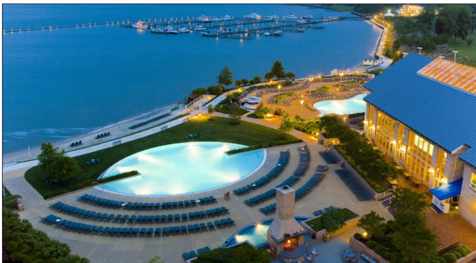
The Infinity Pool