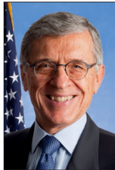
FCC Chairman Tom Wheeler

To register an individual, click here or go to the FCBA Website – Calendar of Events