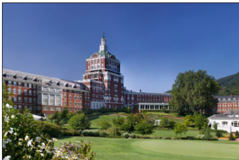
Omni Homestead Resort

or use the form on page 27 . See page 27 for sponsor registration.