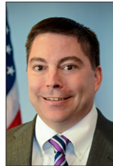
FCC Commissioner O'Rielly

or use the form on page 27 . See page 27 for sponsor registration.