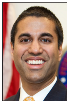
FCC Commissioner Pai

The FCBA will be holding a luncheon in conjunction with its annual meeting on Wednesday, June 18, 2014 . The program will include announcement of the FCBA election results, a presentation of awards, as well as recognition of scholarship and internship awardees, lunch, and remarks by FCC Commissioner Ajit Pai . The luncheon will be held at the Capital Hilton, 1001 16th Street, NW. Registration begins at 11:30 a.m. and the luncheon begins at Noon. Please note that tables of 10 are available, although you cannot register online for this option; you must download the form and fax or email it in with attendee names.