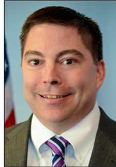
FCC Commissioner Michael O'Rielly

The FCBA will be holding a luncheon in conjunction with its annual meeting on Thursday, June 11 . The program will include announcement of the FCBA election results, a presentation of awards, as well as recognition of scholarship and internship awardees, lunch, and remarks by FCC Commissioner Michael O'Rielly . The luncheon will be held at the Capitol Hilton, 1001 16th Street, NW. Registration begins