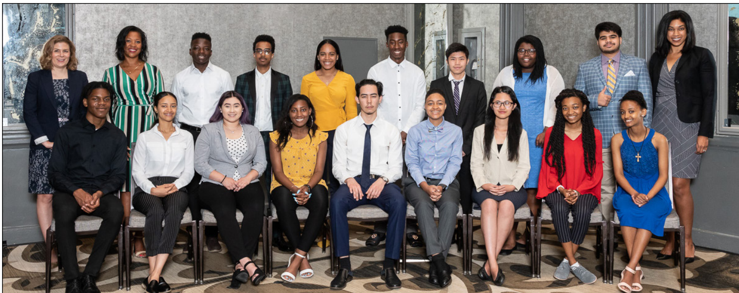
FCBA Foundation College Scholarship Recipients