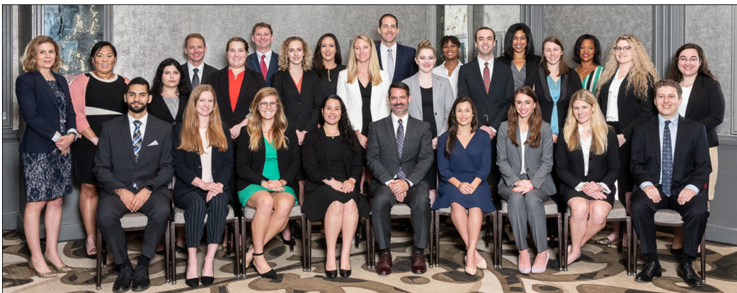
FCBA Foundation Law School Scholarship and Stipend Recipients