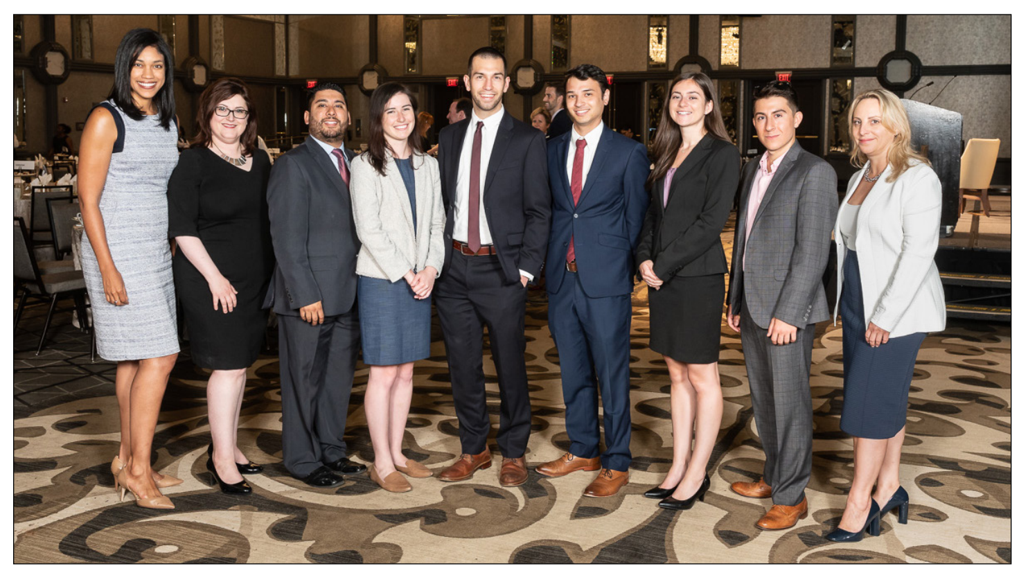
FCBA Foundation Law School Scholarship Recipients