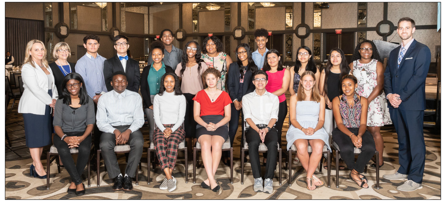
FCBA Foundation College Scholarship Recipients