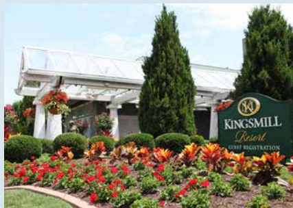
Kingsmill Resort in Williamsburg, VA

We hope you'll join us at the 2023 FCBA Annual Seminar!