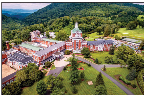
Omni Homestead Resort

Important Room Reservation Information: The FCBA special group rate will only be guaranteed through MONDAY, MARCH 7. The