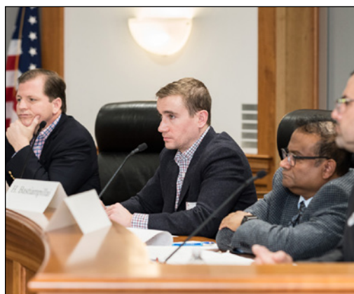
24th Annual National Telecommunications and Technology Moot Court Competition

The competition seeks attorneys to serve as Oral Arguments Judges and Briefs Judges. Briefs Judges will receive submitted briefs on or around Wednesday, January 30 and they will be due back on Wednesday, February 13. A score sheet provided by the Committee will guide Briefs Judges in grading the briefs and allocating points. Oral Arguments Judges are needed for the competition rounds on both Friday, February 15 and Saturday, February 16.