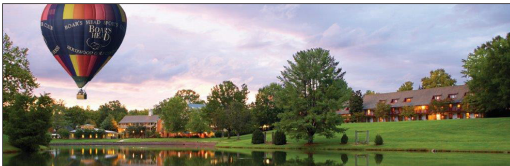
The Boar's Head Inn in Charlottesville, VA

Mark your calendars now and join your colleagues at the 2016 FCBA Annual Seminar at the Boar's Head Inn in Charlottesville, VA. The Annual Seminar Committee is planning what promises to be an outstanding program filled with the latest information on telecom issues and great networking opportunities.