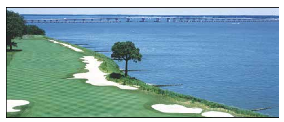
The River Marsh Golf Club

Additional information about the resort and its surroundings can be found at www. chesapeakebay.hyatt.com . Future newsletters and the website will have further information about the schedule, agenda, and registration procedures.