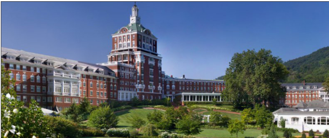
Omni Homestead Resort

The Nominations Committee will present a slate of nominations to the membership via email and the in newsletter. At that point, members will have the option of making additional nominations as outlined in the Bylaws.