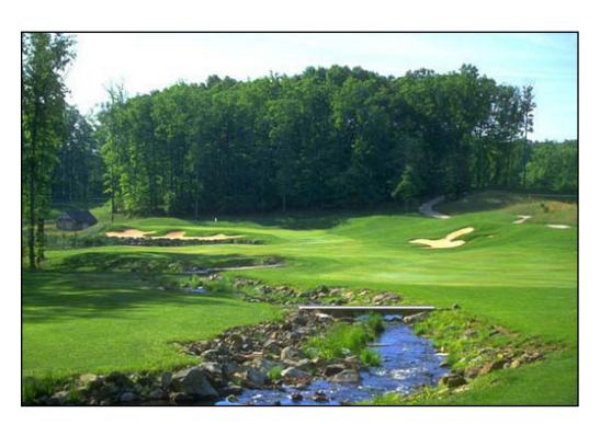
Westfields Golf Club

Although many activities are currently either canceled or very limited, golf has largely remained unscathed by the pandemic—which makes this a wonderful opportunity to get out and enjoy the outdoors with colleagues and friends while adhering to social distancing guidelines. So get a foursome and compete