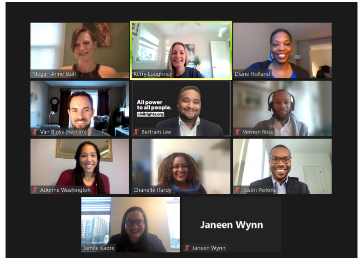
Howard University School of Law (HUSL) and FCBA TMT Law Career Panel & Networking Mixer on October 21