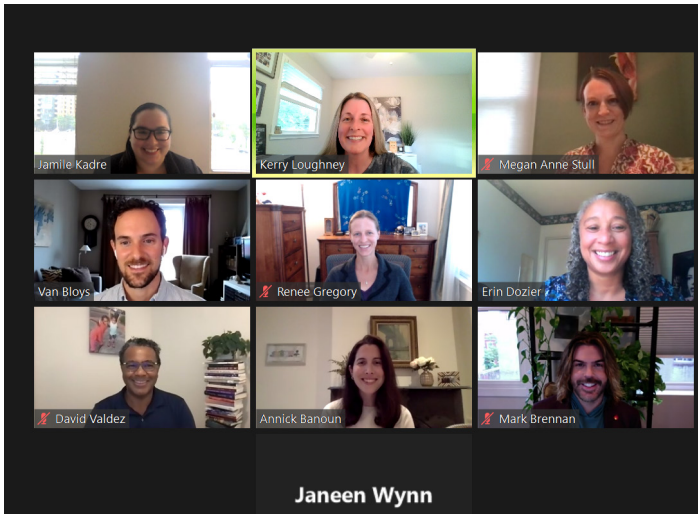
Georgetown University Law Center (GULC) and FCBA TMT Law Career Panel & Networking Mixer on October 7