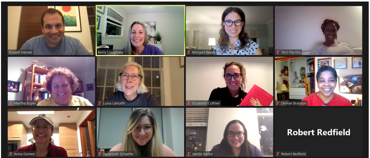
Inaugural Meeting of the FCBA Book Group on Technology in Fiction held October 14