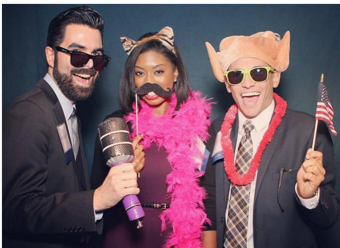
The 2016 Charity Auction photo booth