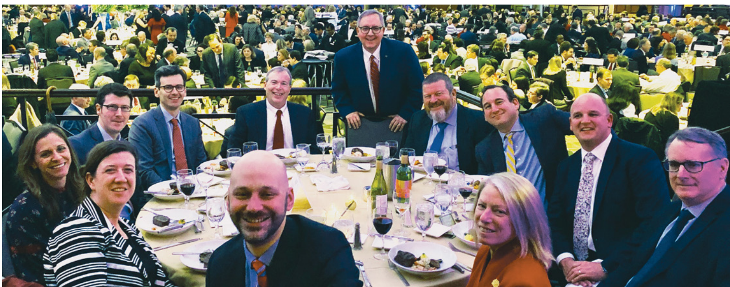
The ACA Connects team at the 2019 Chairman's Dinner