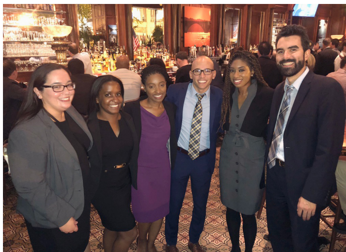
The 2017 Charity Auction after party