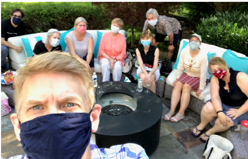
A Book Club meeting – masked, of course!