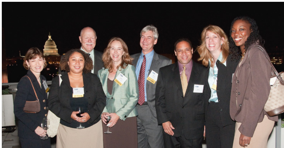
FCBA Fall Reception at the Newseum in 2009