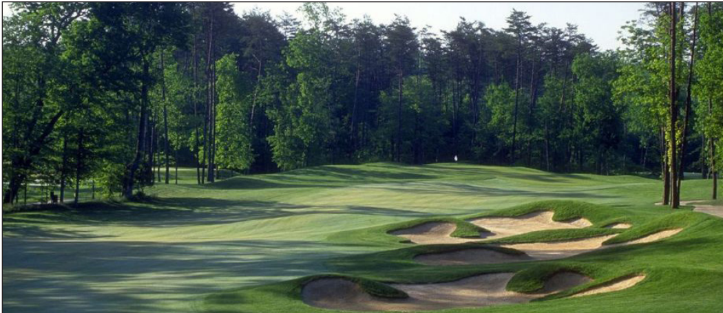
Westfields Golf Club