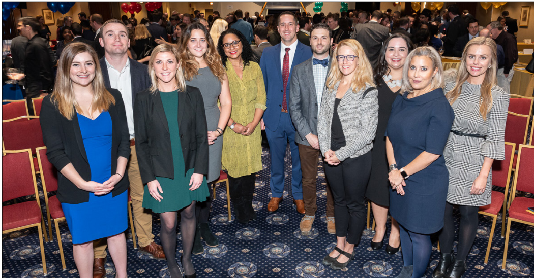
The 2019 Charity Auction Committee