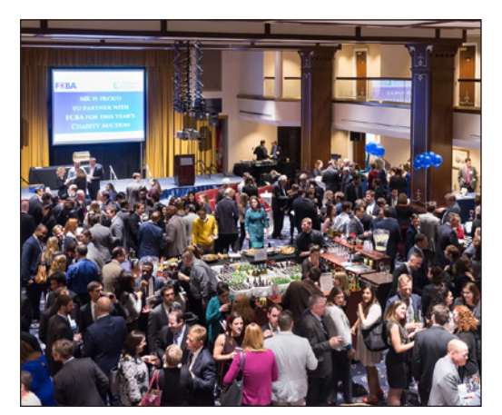
27th Annual FCBA Charity Auction

Proceeds from this year's Charity Auction will benefit two great, local charities— Supporting and Mentoring Youth Advocates and Leaders (SMYAL) and the FCBA Foundation . In 1984, local youth service professionals and community activists organized a conference after learning that "cross-dressing" youth from local schools were being institutionalized in a psychiatric hospital. From this, SMYAL was founded to meet the needs of LGBT youth in the Washington, DC area. Today, SMYAL supports and empowers youth by creating opportunities to build self-confidence, develop critical life