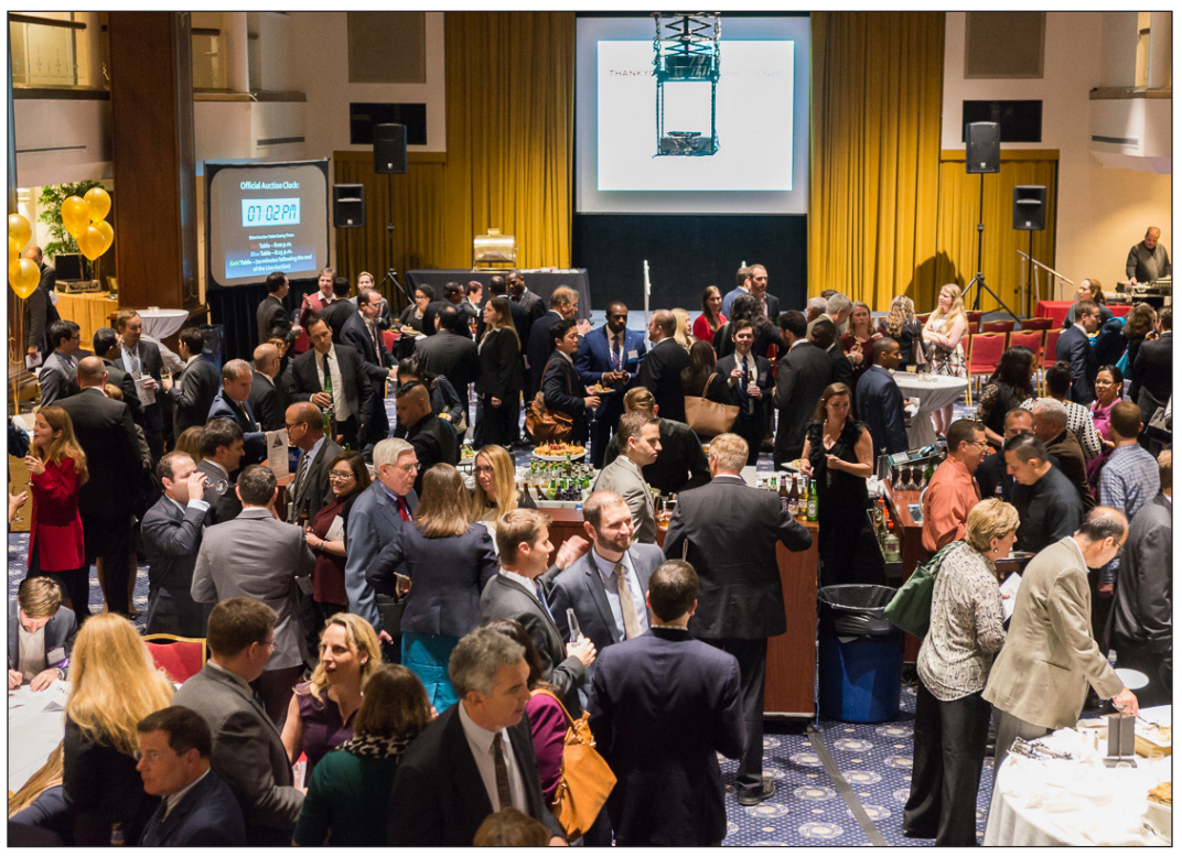
2015 FCBA Charity Auction

Newsletter of the Federal Communications Bar Association