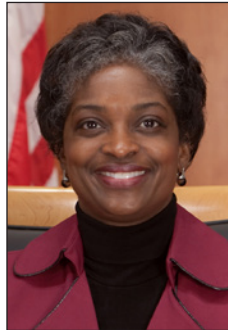
Acting Chairwoman Mignon Clyburn

The FCBA will be holding a luncheon on Tuesday, September 24, 2013 featuring FCC Acting Chairwoman Mignon Clyburn. The luncheon will be held at the Grand Hyatt Hotel, 1000 H Street, NW. Registration will begin at 11:30 a.m. and the luncheon will begin at Noon. Please note that tables of 10 are available, although you cannot register online for this option; you must download the form and fax or email it in with attendee names.