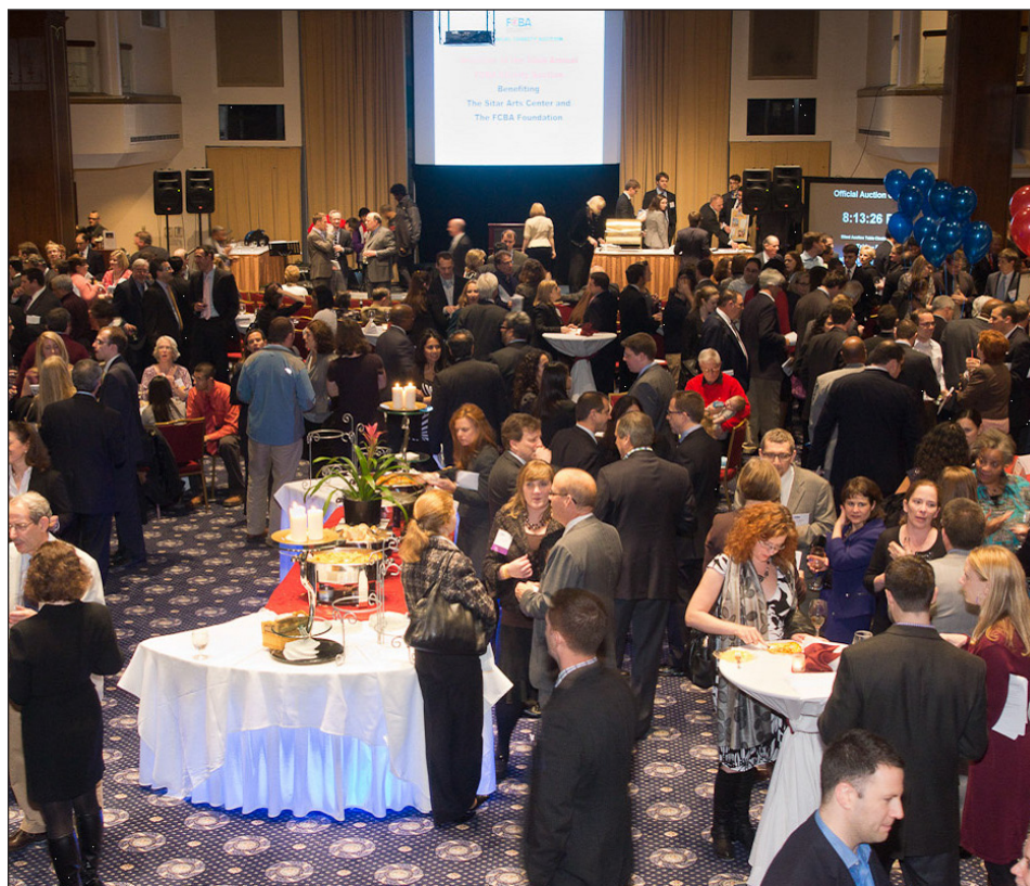
2012 Annual FCBA Charity Auction

Over the past 23 years, the Charity Auction has raised more than $1.3 million for DC-based organizations, including the DC Children’s Advocacy Center, STEP/Have a Dream, the Charitable Coalition