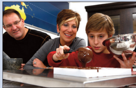
The Chocolate Lab

The Saturday afternoon tour begins with lunch on your own at Café Zooka, inside The Hershey Story, The Museum on Chocolate Avenue. As a dessert portion of your meal, tour members will share a Countries of Origin Chocolate Tasting, a chance to hone skills as chocolate connoisseurs or simply enjoy tasting warm drinking chocolate, six single-origin samples from fruity African chocolate flavors to Indonesian chocolate with caramel overtones. This is the right predicate for your reserved place in a 45-minute Chocolate Lab class, describing the history of chocolate and exploring the unique qualities of chocolate through playful, hands-on experiences. This participatory class