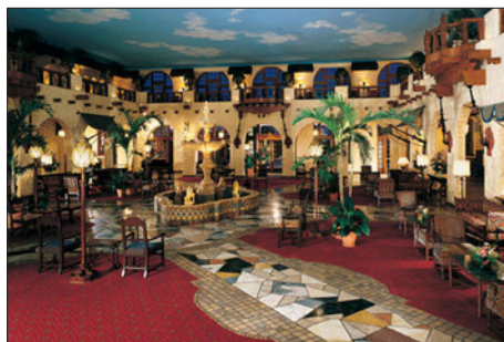
Lobby of the Hotel Hershey