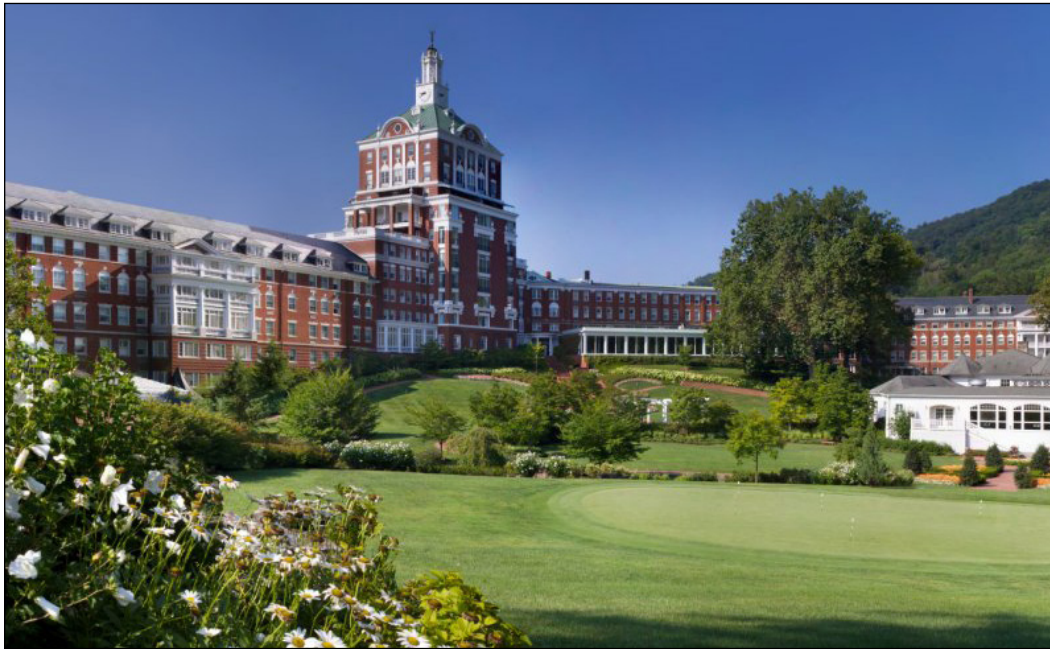
Omni Homestead Resort

Newsletter of the Federal Communications Bar Association