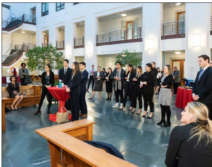
Closing reception following final round argument.