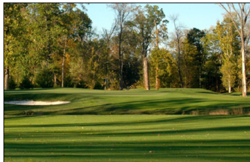
1757 Golf Club

On Tuesday, June 5, we will start a new chapter of the FCBA Golf Tournament by moving to the 1757 Golf Club in Sterling, Virginia. Managed by Billy Casper Golf, 1757 Golf Club is known for its pristine golf course and beautiful facilities, and is located close to downtown DC.