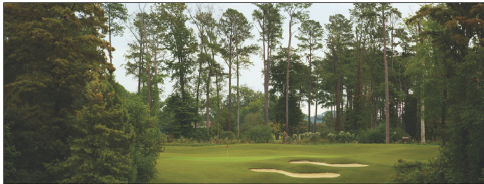
Plantation Golf Course

The social side of the seminar will begin with a reception Friday evening followed by our traditional family BBQ dinner. Following dinner, attendees will have an opportunity to compete for unique prizes at the always popular Bingo Party. Later in the evening the FCBA's Club Karaoke will provide the opportunity for one and all to showcase their singing talents for their colleagues, families, and friends. Saturday will open with our breakfast buffet. Saturday afternoon will feature FCBA golf and tennis tournaments, in addition to a guided tour of Colonial Williamsburg and a tasting at the Silver Hand Meadery followed by mini golf. Saturday evening will feature a reception followed by a dinner buffet and evening activity. Sunday morning the seminar closes with a breakfast buffet.