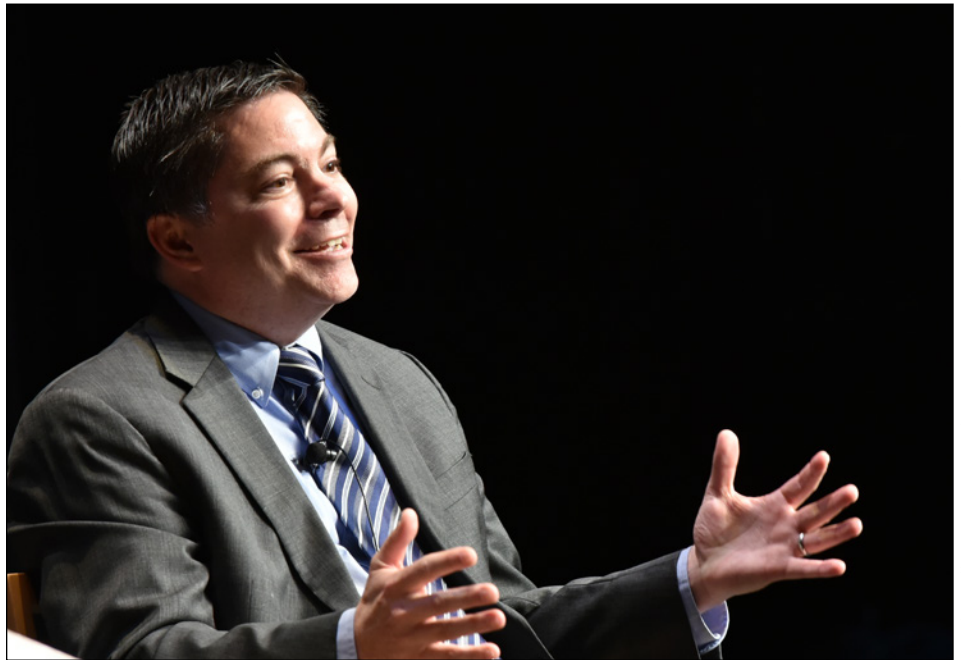
FCC Commissioner Michael O’Rielly

On Saturday, March 24, the Southern California Chapter successfully partnered with the UCLA School of Law to feature a program as part of the annual UCLA Entertainment Symposium. The Symposium is in its 42nd year and is