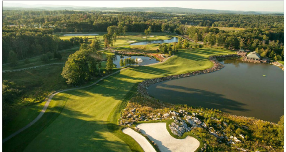
Mystic Rock Golf Course

After carpooling from the resort, our group will lunch "on your own" in the café. Then, our group will be divided so that one knowledgeable guide can conduct about a dozen people on a tour of all of the major rooms of the house for about an hour. In this National Historic Landmark, there is a rhythmic interplay between interior and exterior space due to the numerous terraces, open-air walkways, and unexpected views of the