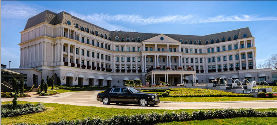
Nemacon Woodlands Resort

The 2017 FCBA Annual Seminar will be held at Nemacon Woodlands Resort in Farmington, PA on May 5-7. The Annual Seminar Committee is planning an outstanding program filled with the latest information on telecom issues and great networking opportunities.