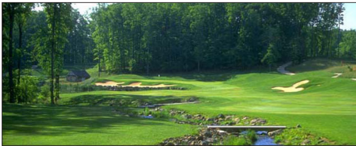
Westfields Golf Club