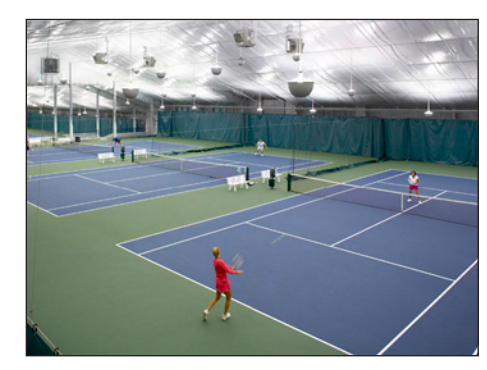
Boar's Head Tennis Center

Golf. Participate in the Annual Seminar Golf Tournament and enjoy an afternoon on the Birdwood Golf Course. With spectacular Blue Ridge views, invigorating vistas, and 18 holes of challenging golf... it is easy to see why Birdwood at Boar's Head is a highly acclaimed course, with recent accolades including the prestigious 4 1/2-star ranking among Golf Digest's 'Best Places to Play.' At the par-72 championship golf course, you can enjoy a course-side meal or snack at the seasonal Birdwood Grill overlooking the 18th hole. Also, enjoy refreshments from the beverage care courtesy of Verizon while on the course!