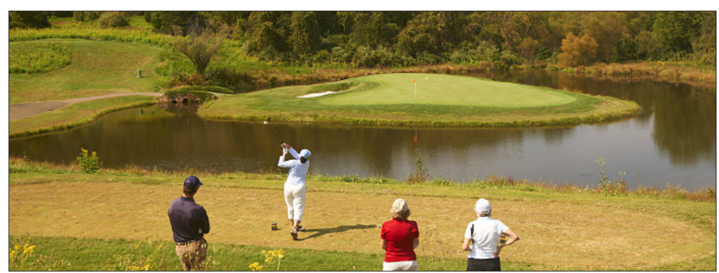
Birdwood Golf Course