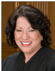
Supreme Court Associate Justice Sonia Sotomayor

The FCBA will be holding a luncheon in conjunction with its annual meeting on Wednesday, June 5, 2013. The program will include announcement of the FCBA election results, a presentation of awards, as well as recognition of scholarship and