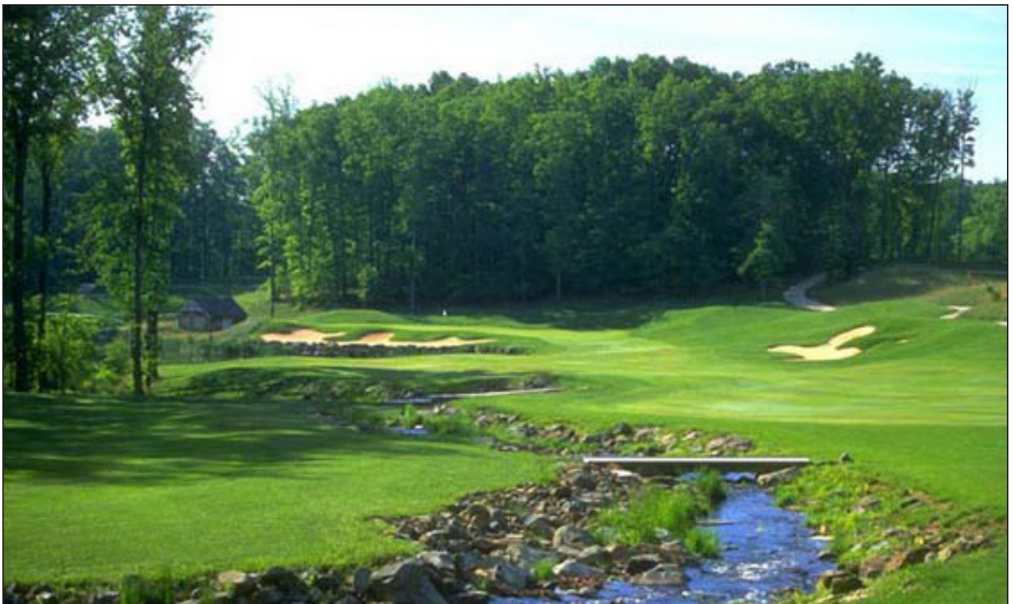
16th Hole at the Westfields Golf Club