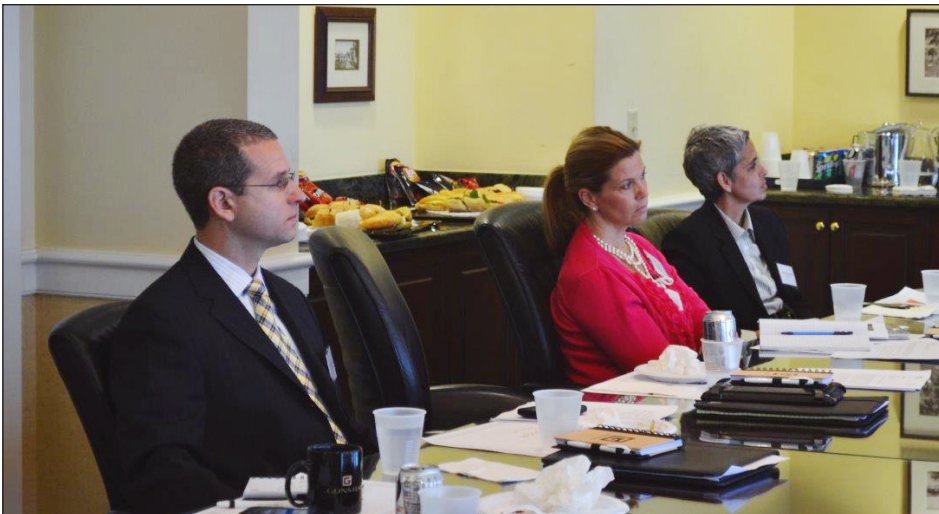
Florida Chapter Program on April 5