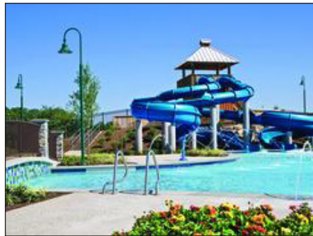
Pool Complex at the Hotel Hershey