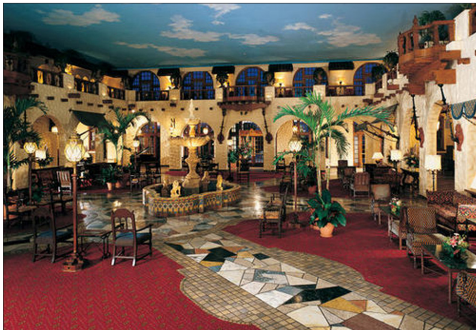
Lobby of the Hotel Hershey

How did Milton Hershey go from bankruptcy to brilliance, transforming chocolate from a luxury to an everyday treat? How did he invent a community? Why did he give away his fortune? That is the Hershey story.