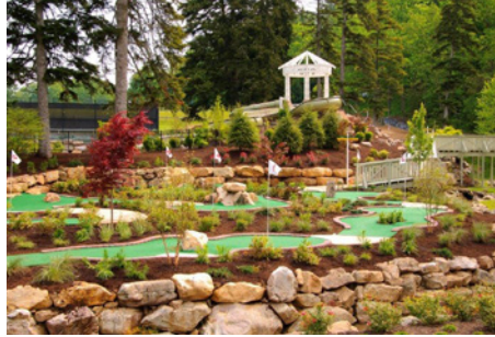
Mini Cascades Miniature Golf Course

Allegheny Springs has expanded the outdoor pool complex into a two-acre water park fueled by water from our native springs. Experience the exhilarating