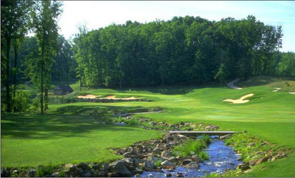
Westfields Golf Club