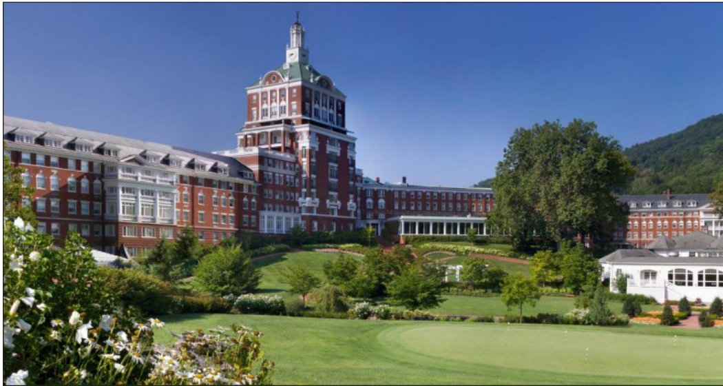
The Omni Homestead Resort

Newsletter of the Federal Communications Bar Association