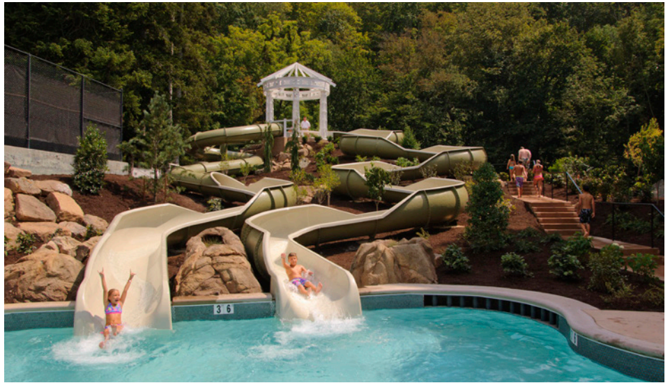
Water slides in Allegheny Springs