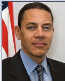
William Kennard, FCC Chairman, 1997-2001