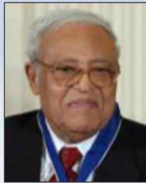
Dr. Benjamin Hooks, FCC Commissioner, 1972

Hon. "Leon" Higginbotham Jr. was an American civil rights advocate, historian, presidential advisor and federal judge. At 34, he became the youngest person to be named a Commissioner at the FTC and the first African American to be a member at the commission level of a federal regulatory agency.