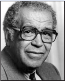
Aloyisus Leon Higginbotham Jr., FTC Commissioner, 1962-1964

As we continue efforts to develop the next generation of high caliber diverse attorneys and future members of the FCBA, we would like to take a moment to recognize and celebrate Black leaders and trailblazers in the TMT space who have paved the way for our current rising cohort of emerging diverse leaders.