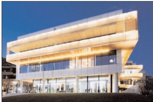
House of Sweden