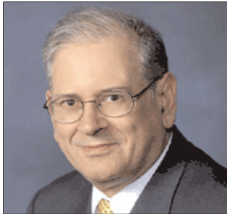
Robert E. Kahn, chairman and CEO of the Corporation for National Research Initiatives

More than a dozen intergovernmental organizations are deciding rules for the networked world, focusing on issues such as taxation, electronic ID, domain names, digital copyright, security, privacy, cybercrime, e-contracting, dispute resolution, consumer protection, foreign commercial relations, and free speech. Join us as we discuss these issues with Internet founding fathers and visionaries Vinton G. Cerf , Chief Internet Evangelist for Google, and Robert E. Kahn , chairman and CEO of the Corporation for National Research Initiatives.