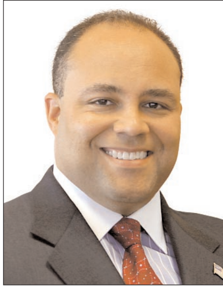
Chairman Michael K. Powell

The Chairman's Dinner sells out each year , so be sure to order your tickets early. Ticket orders and payment