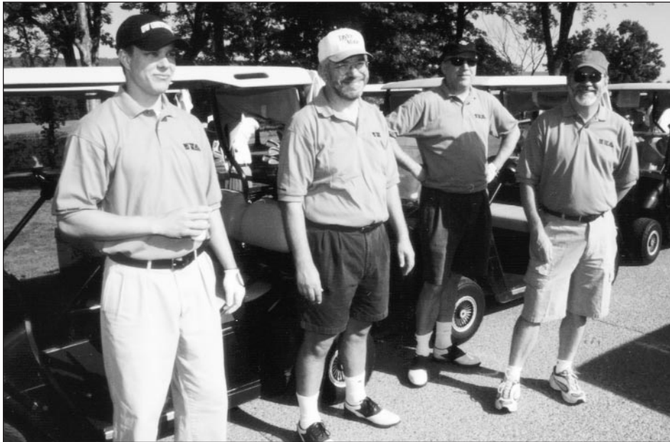
The ITA team