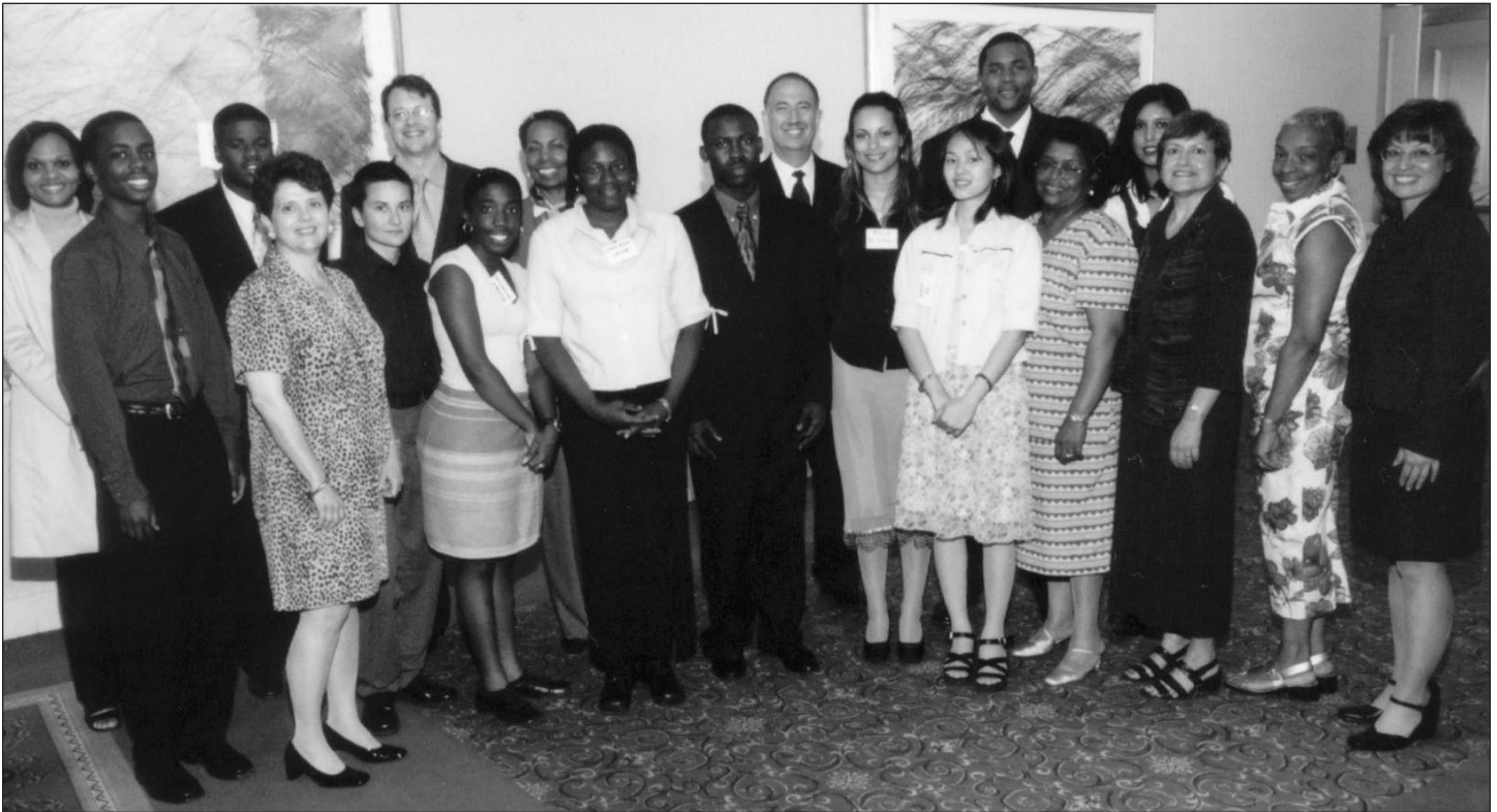
2002 Foundation Scholarship winners and Foundation Trustees