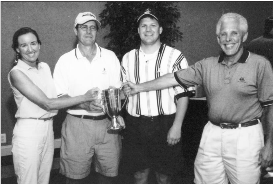
The Wiley Rein & Fielding team wins again