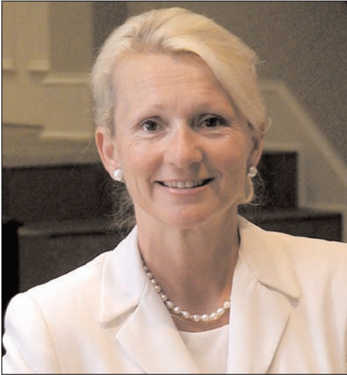
FCC Commissioner Deborah Taylor Tate