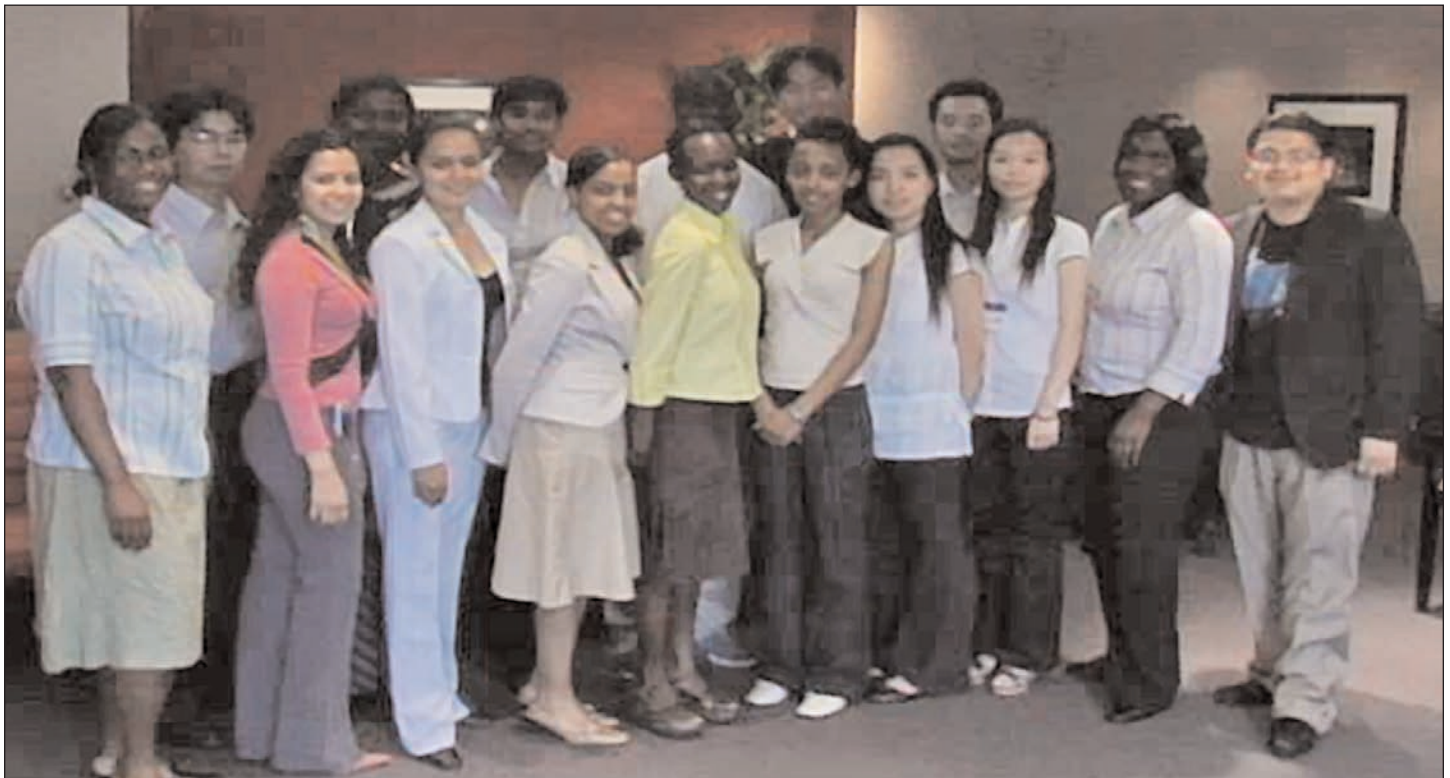
FCBA Foundation 2006 High School Scholarship Recipients